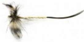
Dry spent Mayfly