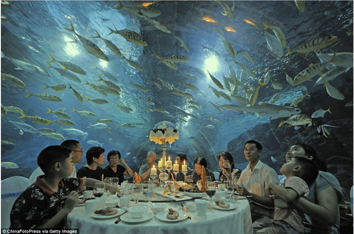
This amazing photo, shows a Candle Lit Dinner at Tianjin Haichang Polar Ocean World

PS. How about this as a Venue for the 2015 Guild Dinner?